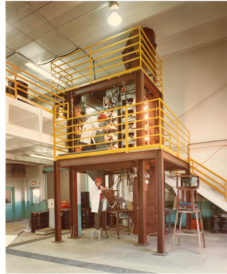
8" x 5" x 20' Bucket Elevator