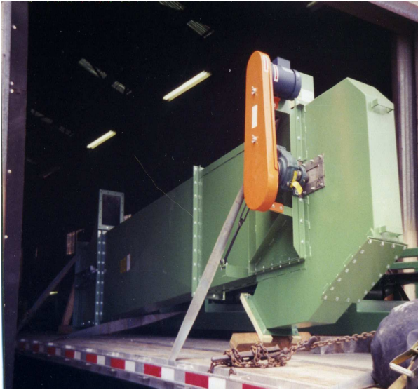
6" x 4" x 15' Bucket Elevator