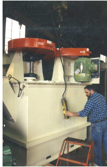
40" x 40" Duplex Attrition Scrubber rubberlined