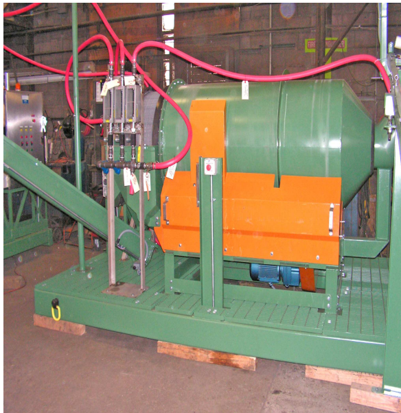
QPEC 30" x 48" Trommel Scrubber Rubber Lined Skid Mounted with Electrical & Plumbing