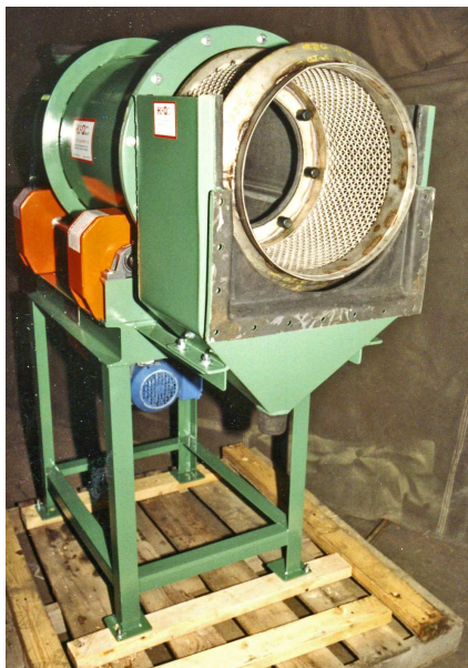
QPEC 24" x 36" Trommel Scrubber Rubber-Lined 316ss Discharge Screen